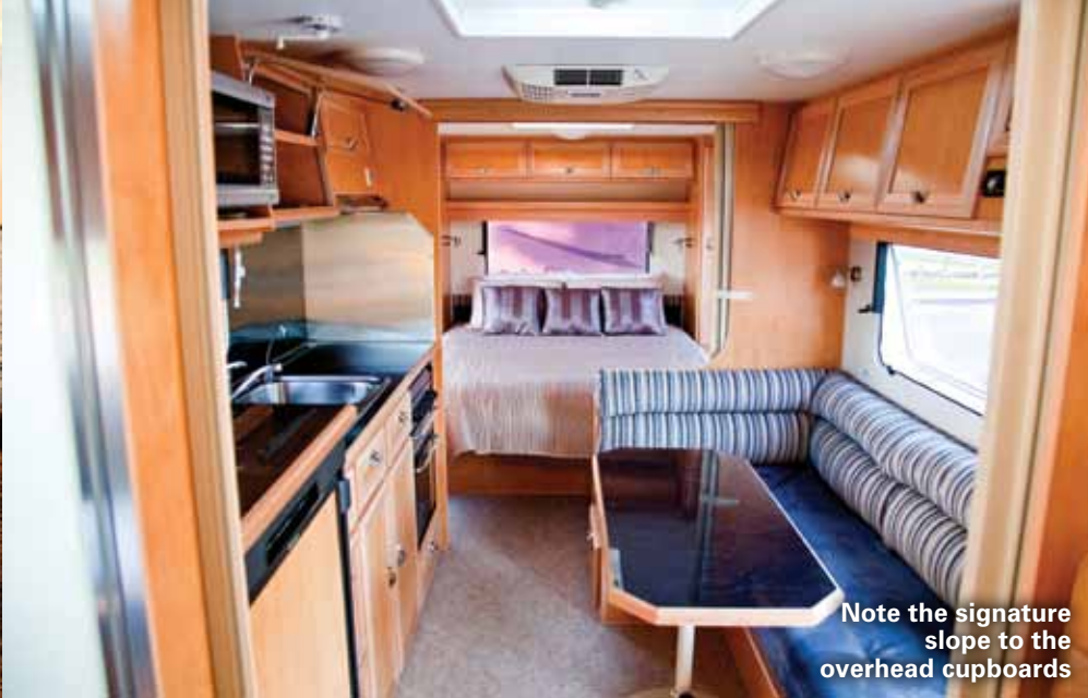
Note the signature slope to the overhead cupboards